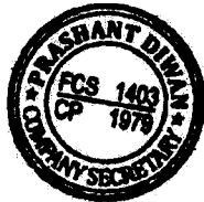
PRASHANT DIWAN SCRUTINIZER